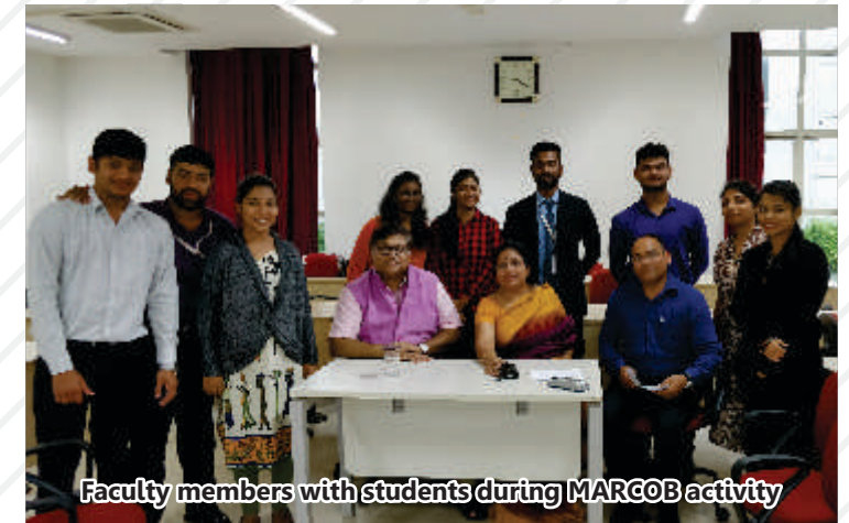
Faculty members with students during MARCOB activity