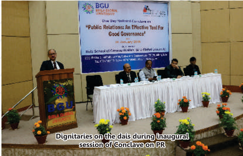
Dignitaries on the dais during inaugural session of Conclave on PR