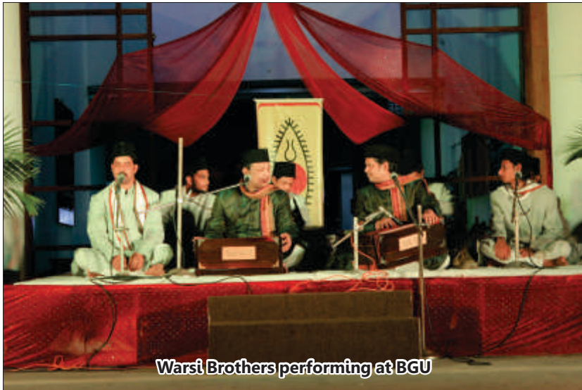
Warsi Brothers performing at BGU

The internationally acclaimed Qawwals, Warsi Brothers, Nazeer and Naseer from Hyderabad, who carry a rich cultural legacy dating back from the courts of the Mughal emperors, graced the campus on 5 November for a performance organised by SPICMACAY, Bhubaneswar.