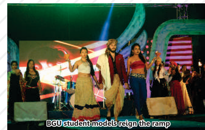
BGU student models reign the ramp