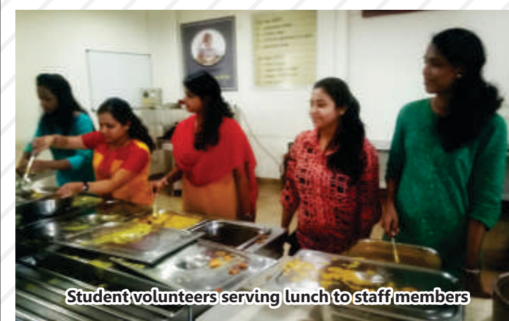
Student volunteers serving lunch to staff members

The students learnt to give back to the staff members who served them on a daily basis. They also understood the difficulty of the serving staff members. It gave some relief to the mess staff who work continuously.