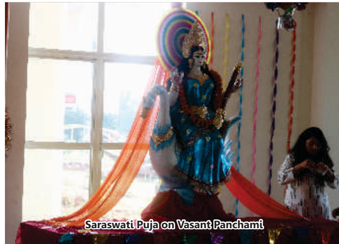
Saraswati Puja on Vasant Panchami

Puja started at 9.00 am in the morning and then Prasad was distributed. The Radio BGU broadcasted special programme based on Basant Panchami on that day.