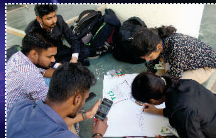
Students busy preparing for advertising competitions