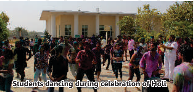
Students dancing during celebration of Holi

The Cultural Conduit of Birla Global University celebrated Holi 2018 with colours of joy, fun, happiness, friendship and harmony. All the students along faculty members and the Dean, SoM, participated in the celebration put-up at Badminton Court of the university.