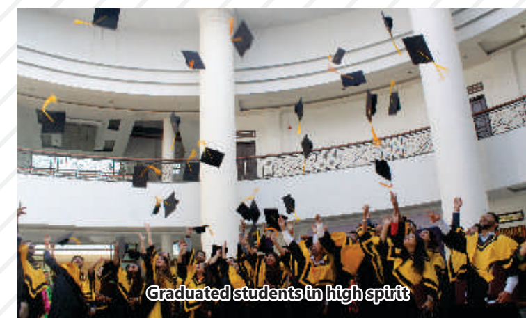
Graduated students in high spirit

BIMTECH, Bhubaneswar, celebrated its third Annual Convocation, the much awaited occasion bringing-in the highest academic satisfaction and sense of accomplishments to the graduating students of PGDM 2015-17 Batch, on 11 November, 2017.