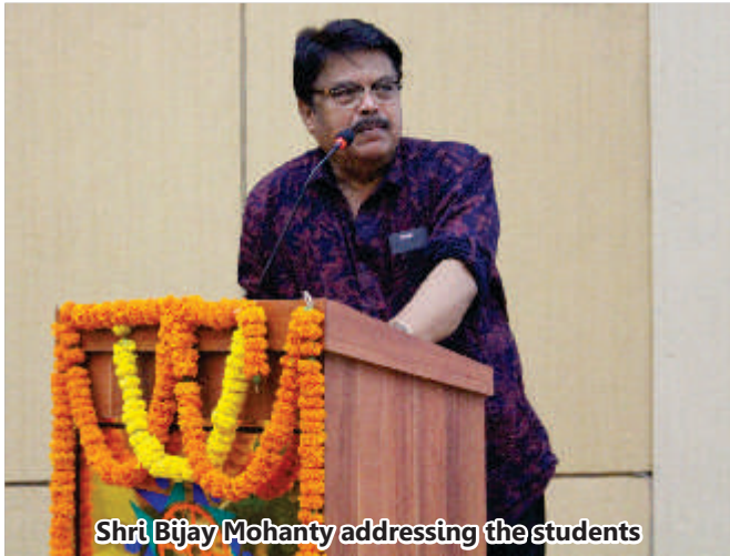
Shri Bijay Mohanty addressing the students

Shri Bijay Mohanty, the megastar of Odia Cinema, visited Birla Global University to address the students of Birla School of Communication. It was an overwhelming time at BGU as the prolific actor shared his experiences with the gathering. Whole BGU family was charmed with his presence and very motivating interaction.