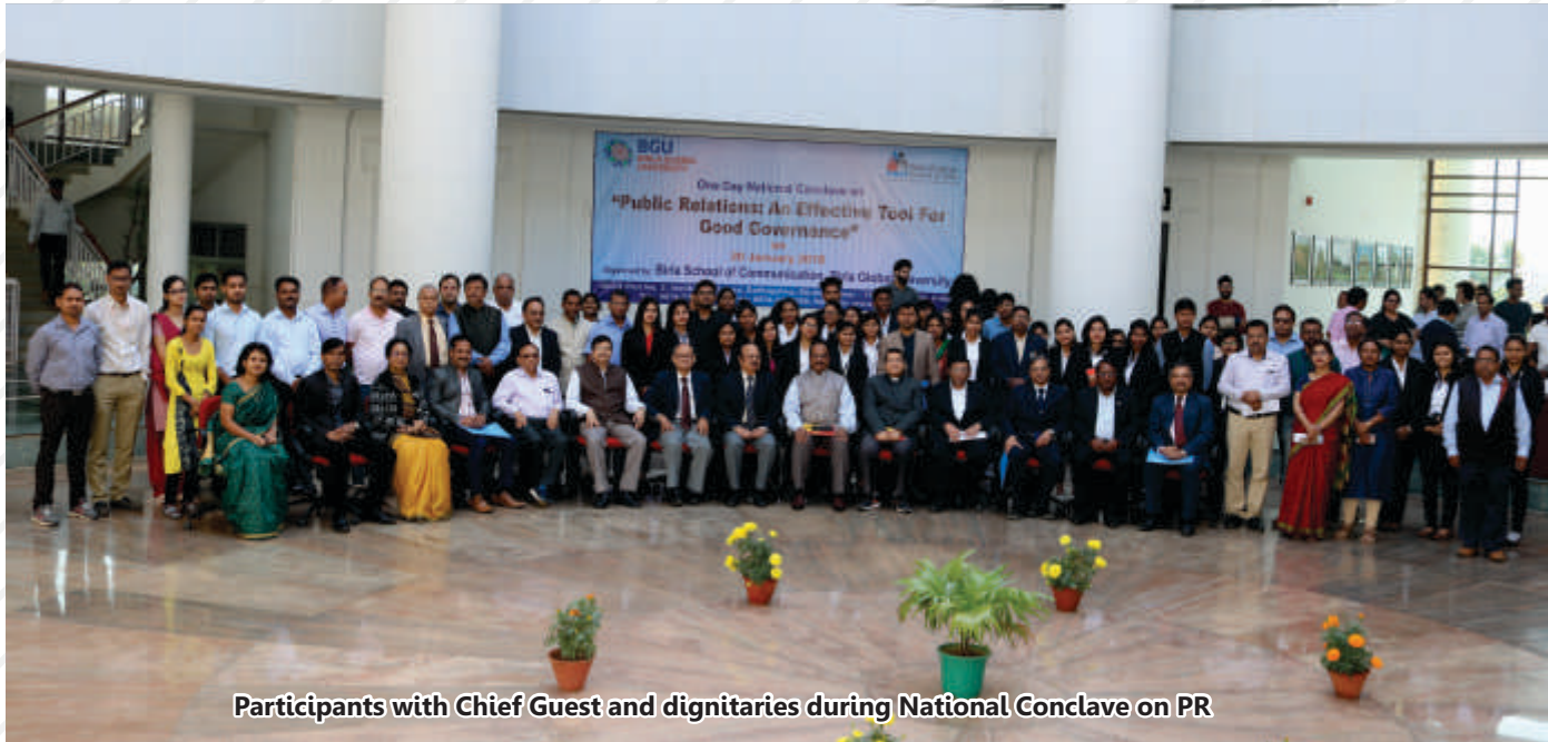
Participants with Chief Guest and dignitaries during National Conclave on PR