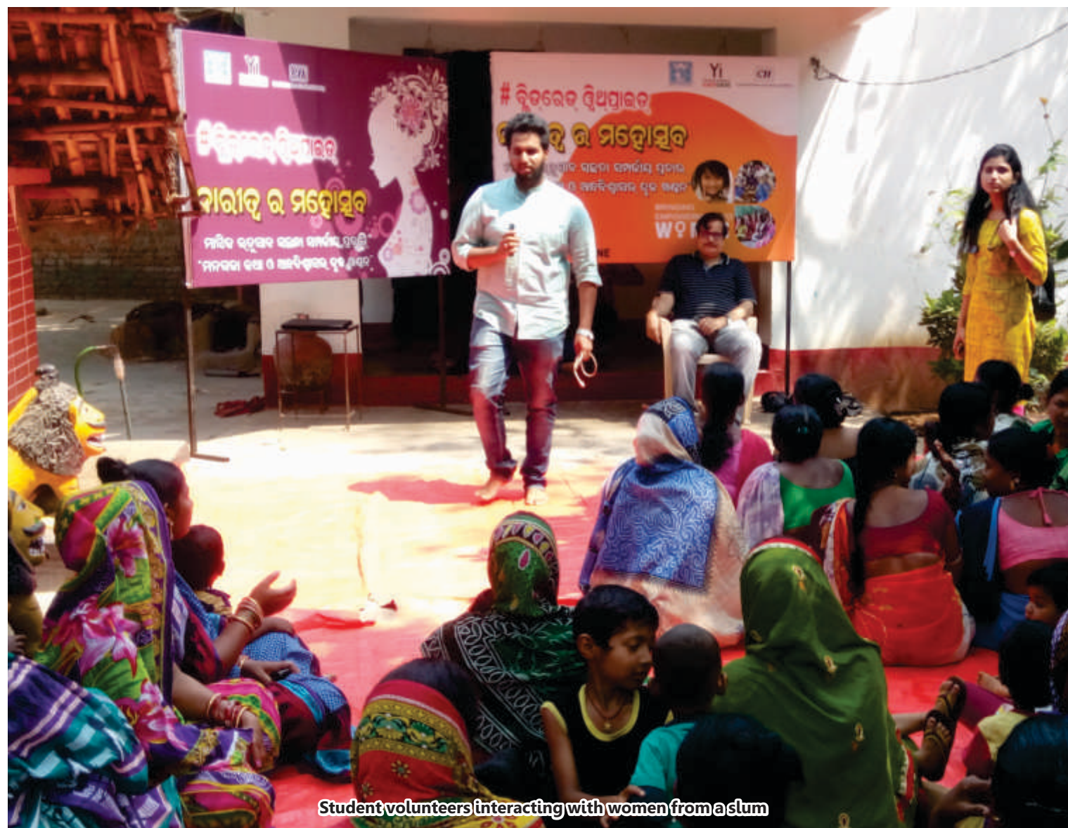
Student volunteers interacting with women from a slum