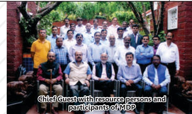
Chief Guest with resource persons and participants of MDP