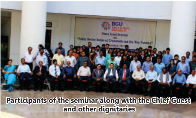
Participants of the seminar along with the Chief Guest and other dignitaries