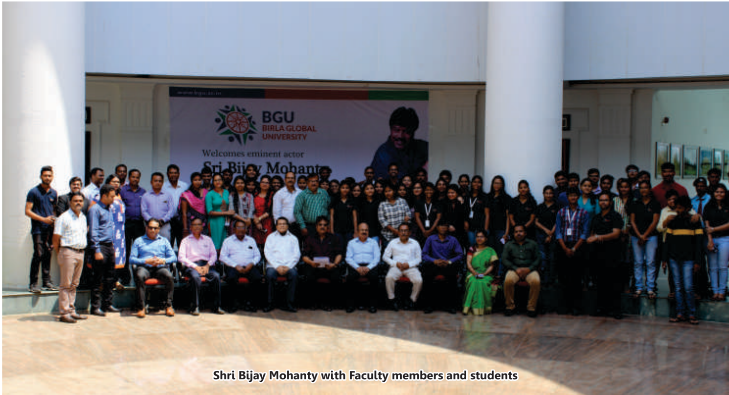
Shri Bijay Mohanty with Faculty members and students

Shri Bijay Mohanty, the megastar of Odia Cinema, visited Birla Global University to address the students of Birla School of Communication. It was an overwhelming time at BGU as the prolific actor shared his experiences with the gathering. Whole BGU family was charmed with his presence and very motivating interaction.