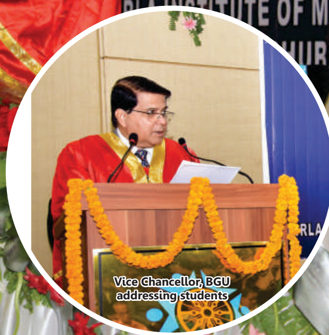
Vice Chancellor, BGMU addressing students

It was a wonderful experience to see the graduates of the institute coming up with flying colours. Euphoria was in the air as the graduates celebrated their graduation day with all ecstasy.