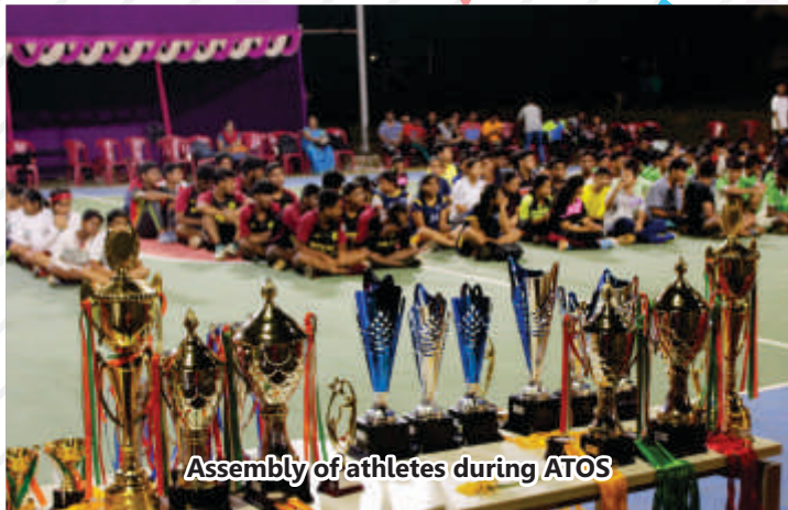
Assembly of athletes during ATOS

All the winners were felicitated with trophies sponsored by Burma Sports and cash prizes.