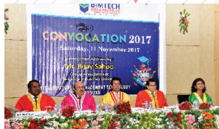
Faculty members and graduating students of BGMU during convocation