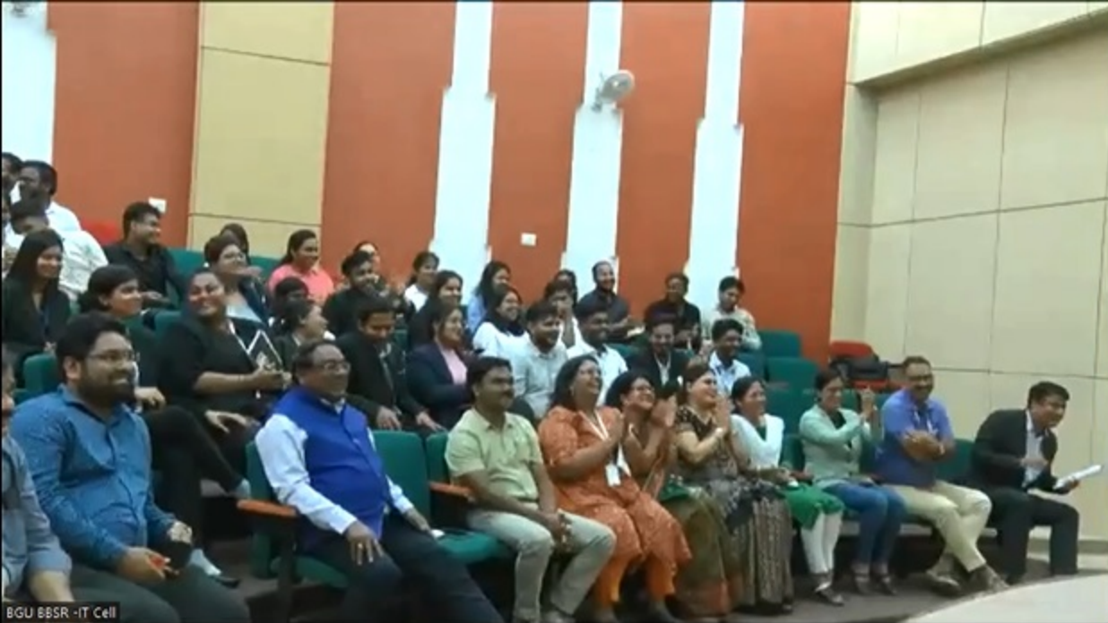
BGU BBSR -IT Cell