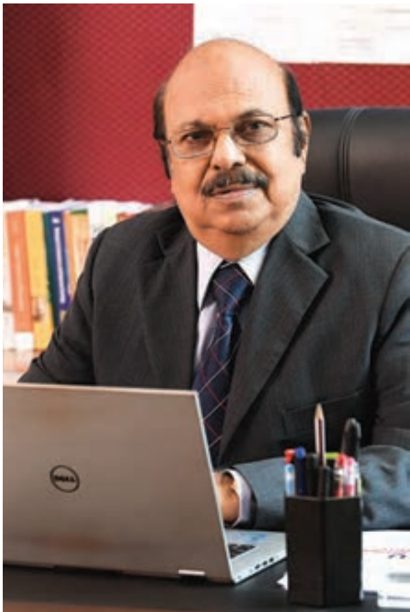
BIRLA GLOBAL UNIVERSITY, BHUBANESWAR

Birla Global University (BGU), established under Birla Global University Act 2015, cater to the needs of higher education not only in India but also plans to extend its reach to global students. Recognized by the University Grant Commission (UGC), Birla Global University committed to provide quality higher education to the meritorious students at Undergraduate, Post-Graduate and Doctoral level.