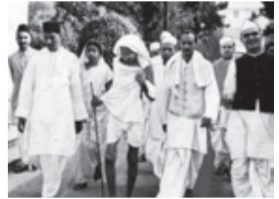
Puja GD Birla with Mahatma Gandhi